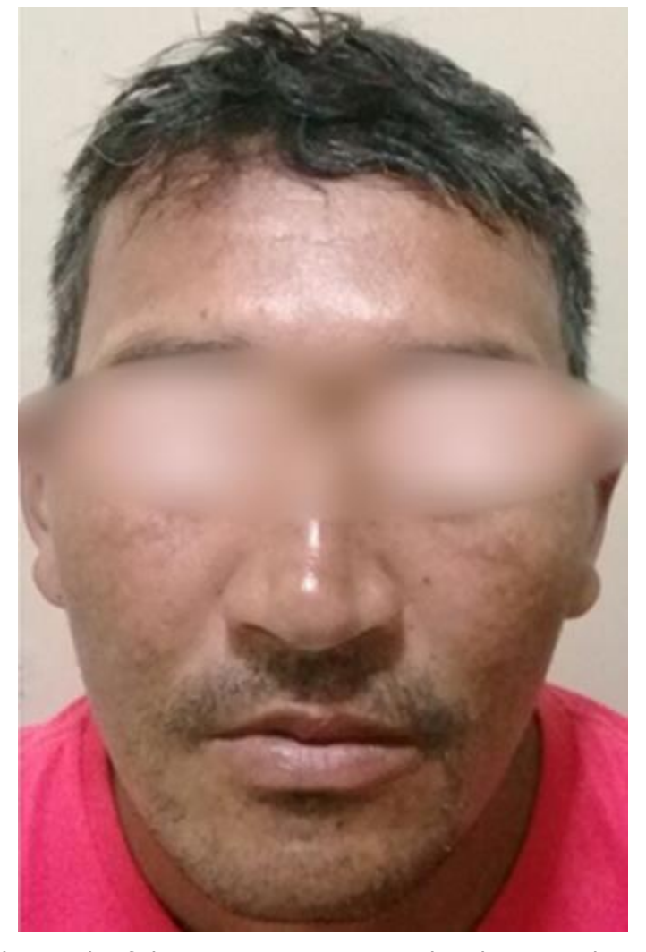
Fig. 3 - Seventh month of the postoperative period without aesthetic and functional complaints.