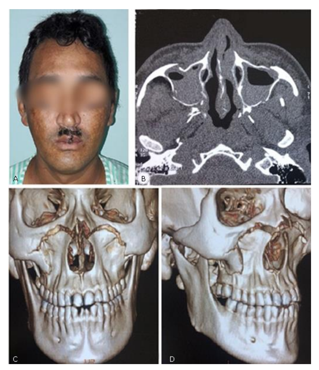
Fig. 1 - A: Clinical characteristics of sinking of the middle third of his face, edema and bilateral periorbital ecchymosis. B: The characteristics of imaging exam tomography. C and D: The imaging exam showed a line of fracture compatible with a high Le Fort I fracture.

Órgano Oficial de la Sociedad Cubana de Estomatología